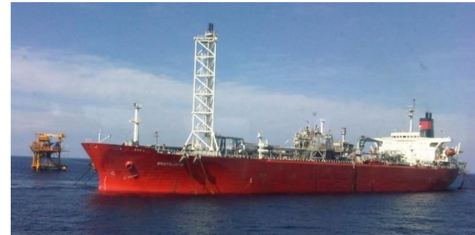
FPSO Brotojoyo at PUO field North Bali